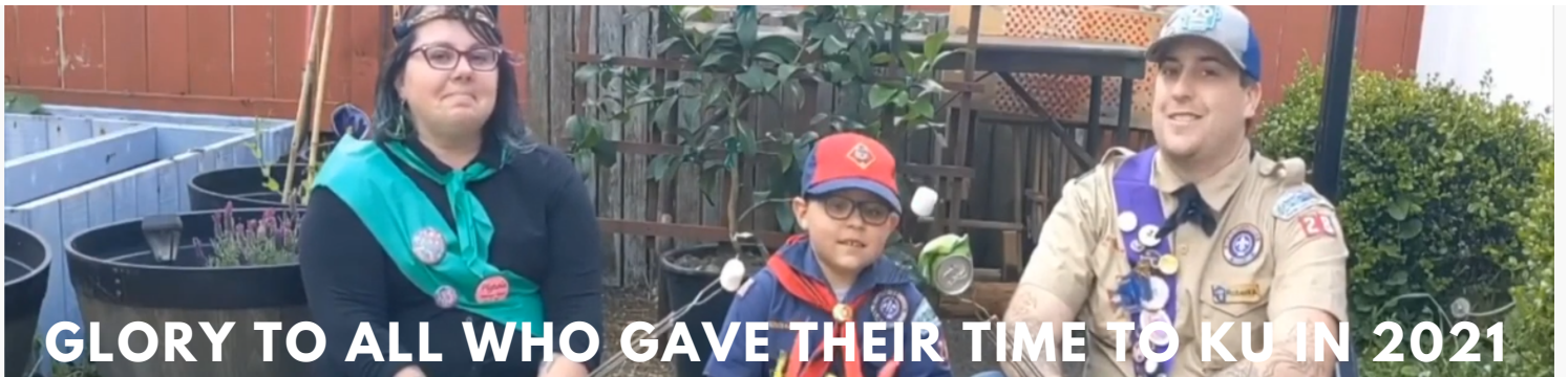
Photo courtesy of the Royal Pain and Friends, winner of the 2021 KSiP